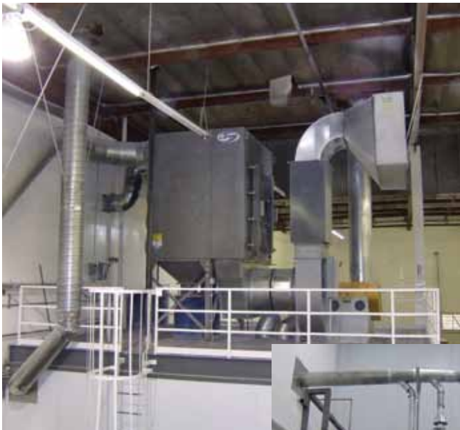
SFC 32-4 with Safety Filter used for blending powdered cheese, baking mixes and tortillas.

S pecial consideration should be taken when choosing an air cleaning system for food processing. Fugitive dusts from breads, cereals, snack foods and seasonings can migrate onto floors and expensive machinery, leading to slippery surfaces and increased maintenance problems. Additionally, it is important to determine the placement and accessories for a dust collector that will be containing combustible ingredients, like sugar and starches.