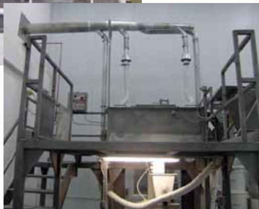
Stainless ducting is used with this dump station. Ducting is attached to SFC 32-4 above.

United Air Specialists can provide the right dust collection package to help avoid safety hazards within your food processing facility. UAS systems provide cleaner air, longer filter life, easy maintenance and overall cost savings. Available in a variety of configurations, our dust collectors can be used in conjunction with all types of material handling, including bin vents, conveyors, chutes, bucket elevators and transfer stations.