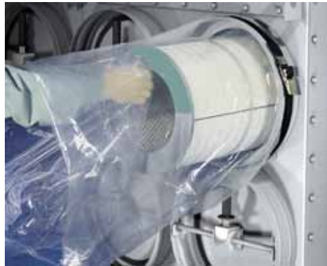
Bag In/Bag Out Filter Change