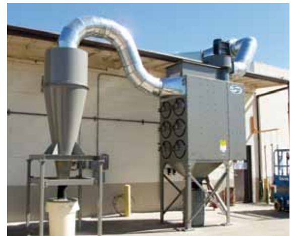
SFC 12-3 with Cyclone used for blending dry dairy and other food ingredients for baked goods and snack foods.