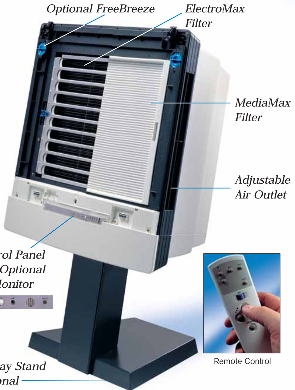
Display Stand Optional